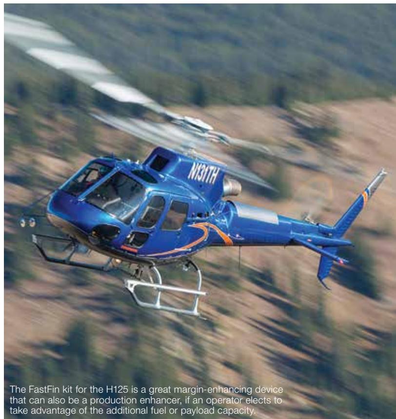
The FastFin kit for the H125 is a great margin-enhancing device that can also be a production enhancer, if an operator elects to take advantage of the additional fuel or payload capacity.

After applying enough power to start a 200 to 300 foot-per-minute climb, I initially had to put some pressure on the right pedal. However, as soon as the climb started and the induced flow across the tailboom increased, I took that pressure out to a near-zero-thrust pedal position and safely, controllably climbed out to pattern altitude, where I restored hydraulic pressure assistance to the tail rotor servo. To operators like myself who perform human external cargo work — which requires pilots to carry their people back to safety in the event of a malfunction — this modification makes hydraulic failures in the dual-hydraulic-equipped Squirrel seem like a non-event, even in the most challenging of conditions.