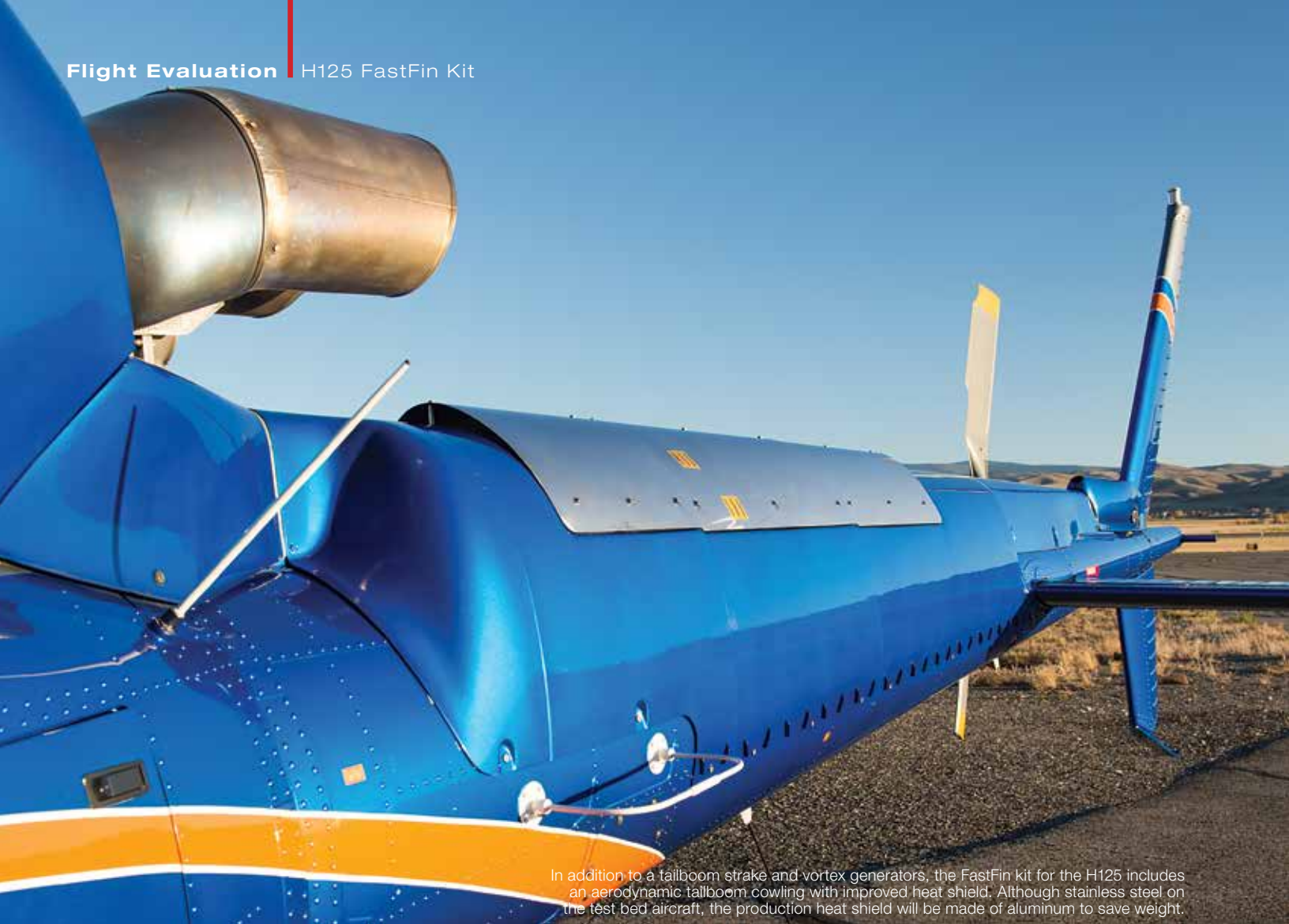
In addition to a tailboom strake and vortex generators, the FastFin kit for the H125 includes an aerodynamic tailboom cowl with improved heat shield. Although stainless steel on the test bed aircraft, the production heat shield will be made of aluminum to save weight.

Unlike BLR's FastFin kits for Bell medium helicopters, the H125 kit does not alter the vertical stabilizer.