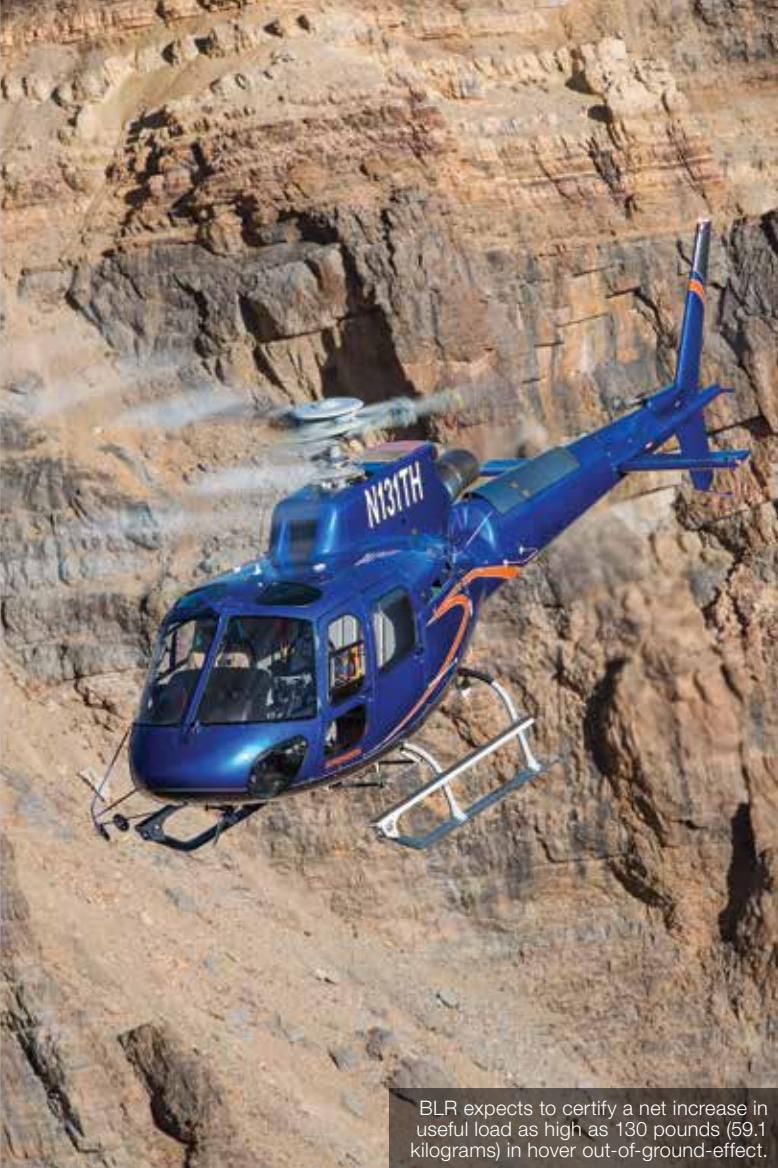
BLR expects to certify a net increase in useful load as high as 130 pounds (59.1 kilograms) in hover out-of-ground-effect.