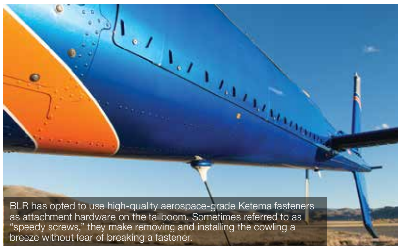
BLR has opted to use high-quality aerospace-grade Ketama fasteners as attachment hardware on the tailboom. Sometimes referred to as "speedy screws," they make removing and installing the cowlings a breeze without fear of breaking a fastener.

the FastFin system, it proved to be so effective and popular with customers that Bell licensed use of BLR's supplemental type certificate (STC) for the technology and has made it standard on all new Bell 412EP and EPI helicopters. I have first-hand experience with the FastFin system through my position as chief pilot of Helicopter Express in Atlanta, Georgia, as a number of the Bell 205 A-1s in our firefighting fleet are equipped with BLR's modifications. So, I've long been familiar with what the company's engineers can offer for those who work on the back side of the power curve.