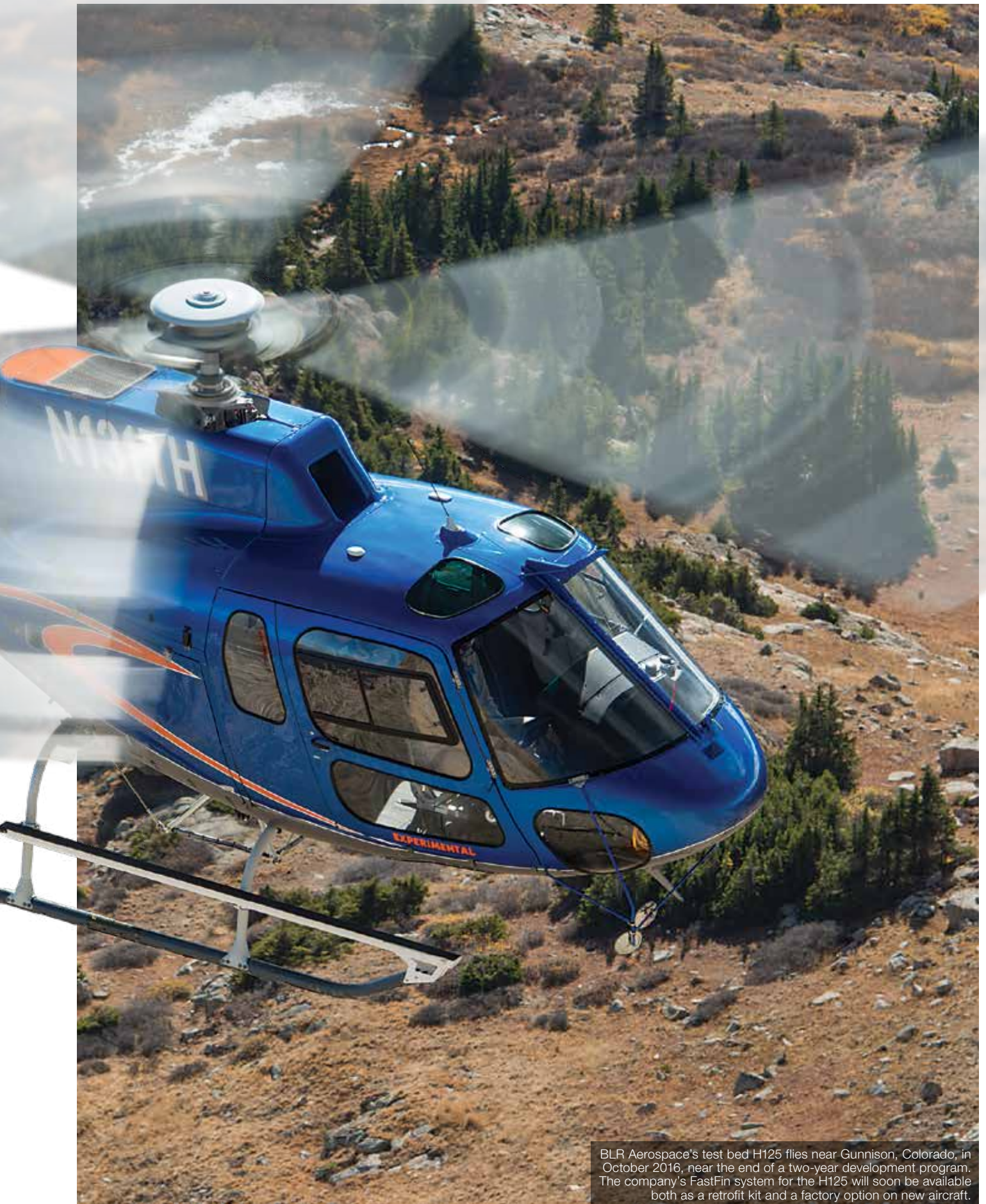
BLR Aerospace's test bed H125 flies near Gunnison, Colorado, in October 2016, near the end of a two-year development program. The company's FastFin system for the H125 will soon be available both as a retrofit kit and a factory option on new aircraft.